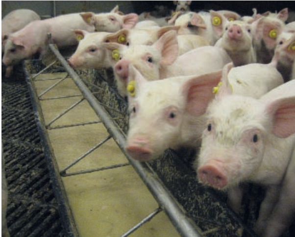
Piglets need about three weeks after weaning to develop their intestinal microflora.